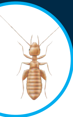
Booklouse 1mm long