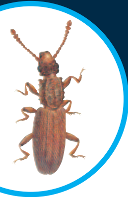
Grain Beetle 3mm long