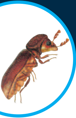
Lesser Grain Borer 3mm long