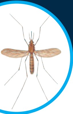
Mosquito Culex spp. 9mm wingspan