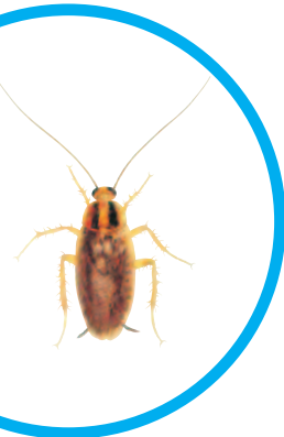
German Cockroach 12mm long