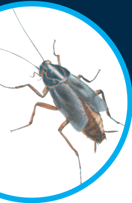
Oriental Cockroach 22mm long