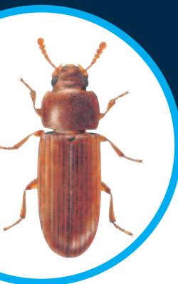
Flour Beetles 3.5mm long