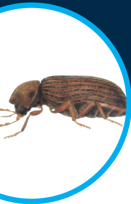
Biscuit Beetle 2.7mm long