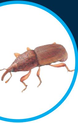
Grain Weevil 3.5mm long